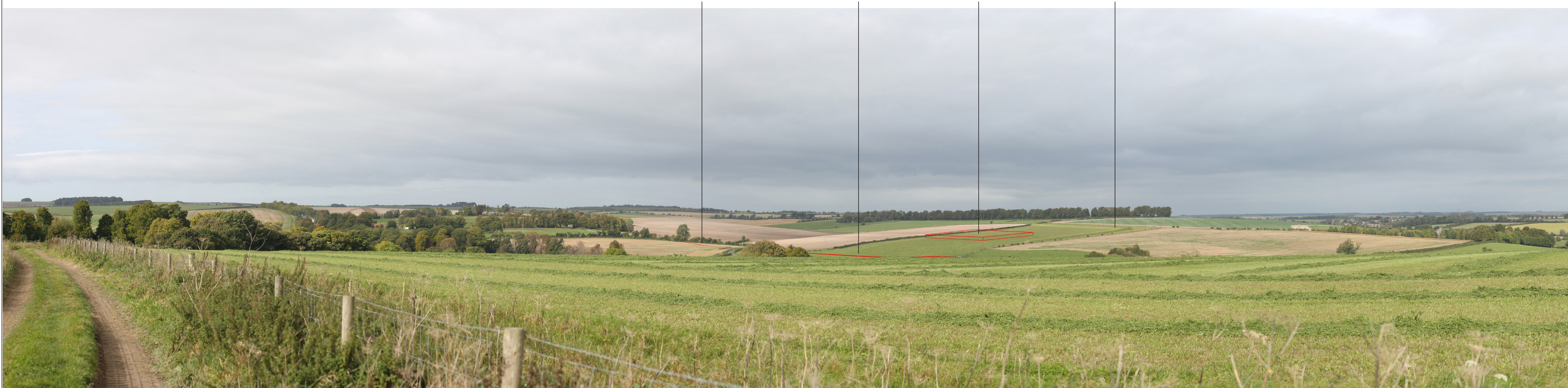
PROPOSED (SUMMER - CONSTRUCTION)

Indicative compound area boarded by topsoil mounds